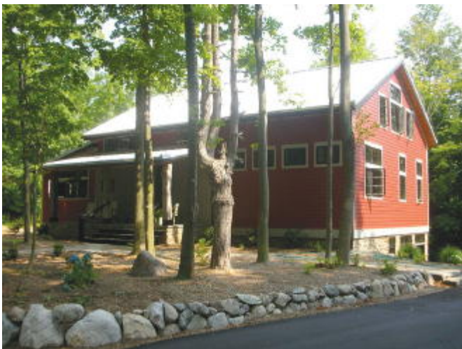
SITE 3 -- TORNVALL BARN | 2007 540 Campbell Road, Douglas A 4,000 sq. ft. reconstruction of an historic barn with a blend of elegant contemporary details. Unsurpassed in use of materials, including historic tile and "green" design.