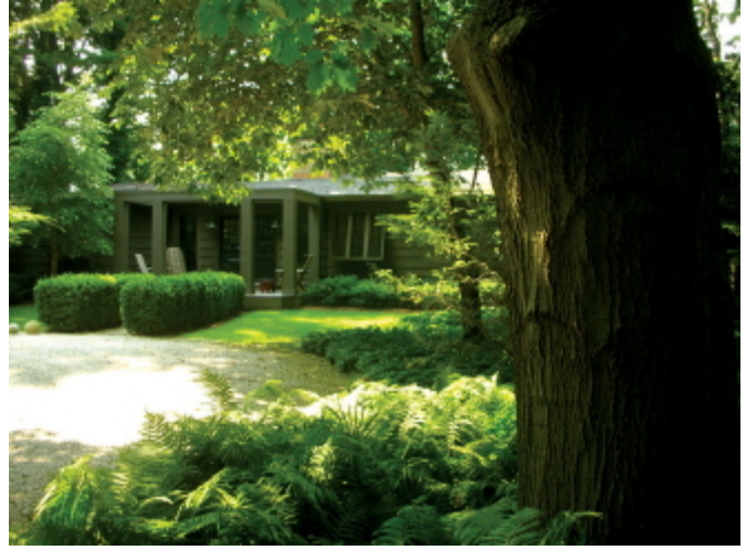
SITE 4 -- KNOLLENBERG HOUSE | 1942 605 Campbell Road, Douglas A "modern" cottage for its era, designed by one of Chicago's first modernist designers for a famous Chicago family. Recently restored by one of Michigan's leading interior designers.