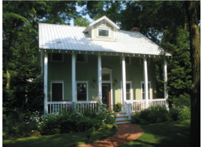
SITE 2 -- SPANGLER HOUSE | 1994 18 Park Street, Saugatuck Small is beautiful. This contemporary house reflects both Saugatuck and Key West design history in an inspiring setting.