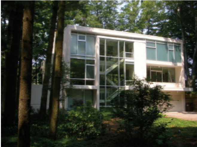
SITE 1 -- KELLY HOUSE | 2007 3740 Riverside Drive, Saugatuck Township Three levels of glass at the Kalamazoo riverside, the inspiration of its glass craftsman-owner, truly brings the outdoors indoor.