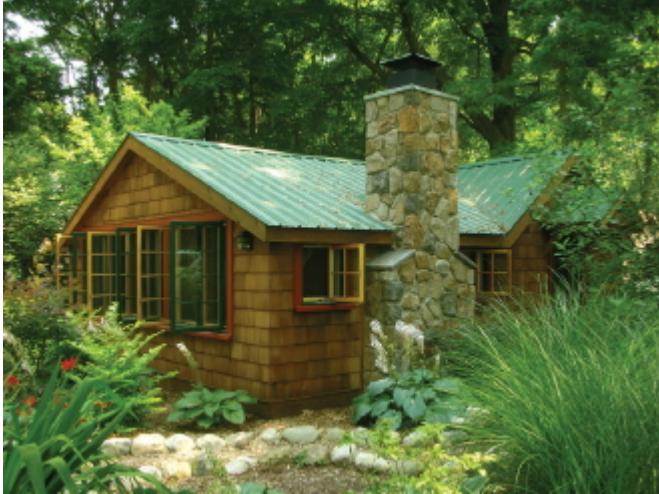
SITE 5 -- TIMBER BLUFF | 1920s-1950s 2729 Lakeshore Drive, Fennville

The ultimate in cottage charm and whimsy. Six little cottages facing Lake Michigan -- all recently brought back to life.