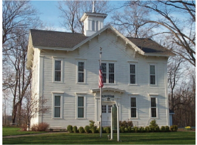
SITE 8 -- OLD SCHOOL HOUSE | 1866 130 Center Street, Douglas

Home of Douglas's most famous Civil War veteran, world traveler, and member of one of the founding families of Douglas. Rich interior. Fine reconstruction by present owner.