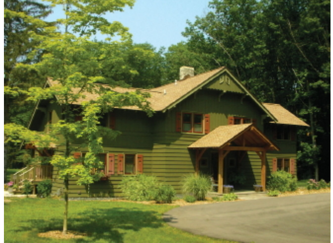
SITE 6 -- BLUE WATER LODGE | 1937 2420 Lakeshore Drive, Fennville

The ultimate in cottage charm and whimsy. Six little cottages facing Lake Michigan -- all recently brought back to life.