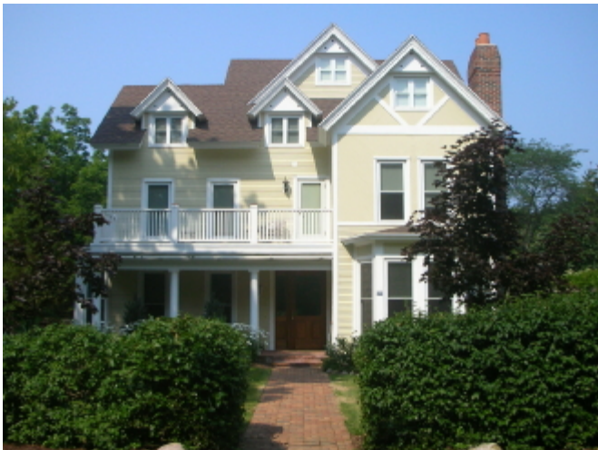
SITE 7 -- DUTCHER-MARK HOUSE | 1889 148 Union Street, Douglas